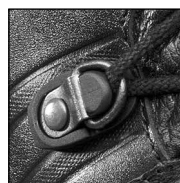
HAIX® 2-Zone Lacing