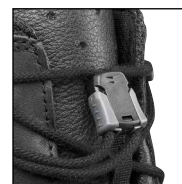
HAIX® Smart Lacing