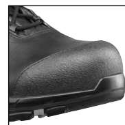
HAIX® Composite toe cap